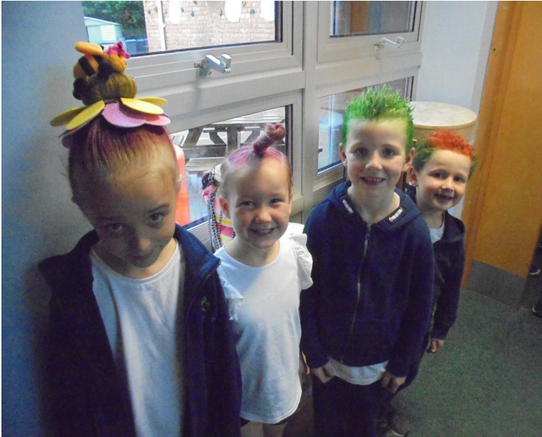
Having fun while raising funds!

Thank you to everybody that came to school today with 'Wacky Hair' in support of the charity 'ToiletTwinning'. We loved seeing all your wacky creations and you helped to raise £110.98 towards this brilliant charity.