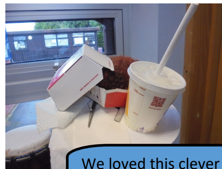
We loved this clever idea of 'burger in a bun!'