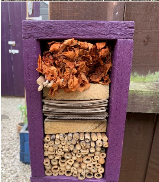
Max's bug hotel.