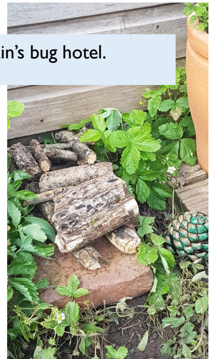
Owain's bug hotel.