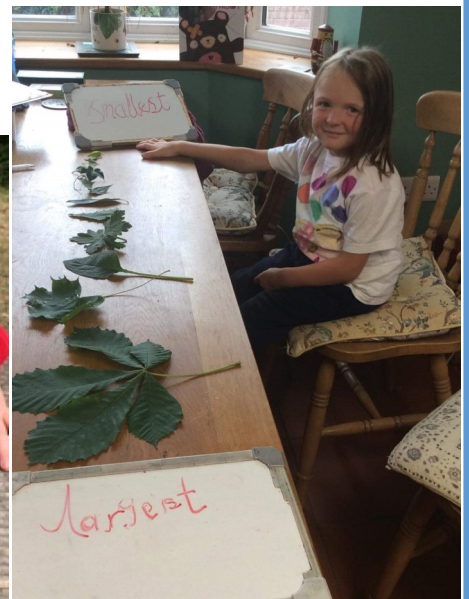
Brilliant leaf and twig sorting based on size.