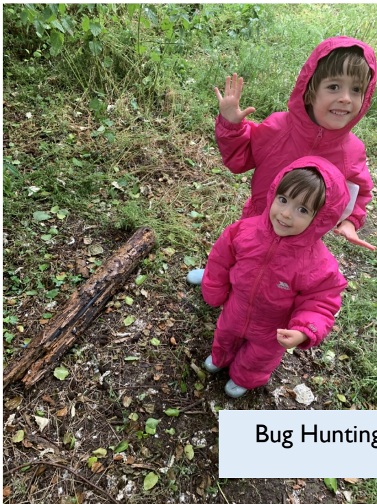
Bug Hunting in all weathers!

Class One have been set home learning tasks that fit in with the theme of 'Habitats'. Children have been going on minibeast hunts, making bug hotels, finding patterns in nature and collecting natural objects to support with language and mathematical development. I have been so impressed with the engagement from pupils and parents, and it has been wonderful to see how families have really embraced home learning with their children. I feel very proud of you all!