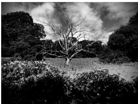
1st Place - Olly

Our Year 5 pupils participated in a photography workshop at Chetwynd Deer Park a few weeks ago where they had the opportunity to photograph nature at its best. Once they were back in school they were able to edit and refine their photographs before they were sent off to be judged. We are pleased to announce our winners were Olly, Izzy and Abi. Well done to all of them and showing such talent. We may have some photographers of the future amongst us!