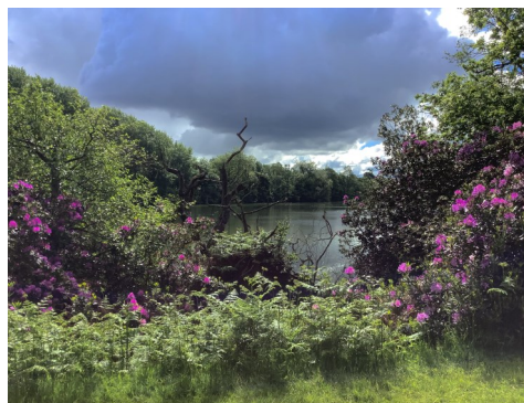
2nd Place - Izzy