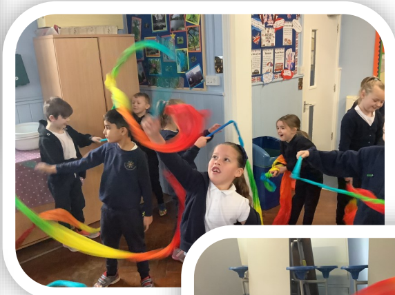
Class 2 wrote their names using ribbons.