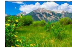
Mount Elbert (USA) is the highest peak in the Rockies.