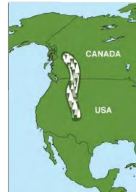
The Rockies are in North America.

Traditional Roman Art Representation of Roman life in art.