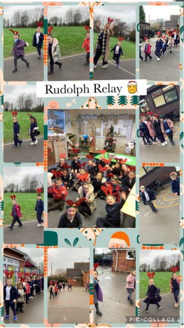
Rudolph Relay 🐇