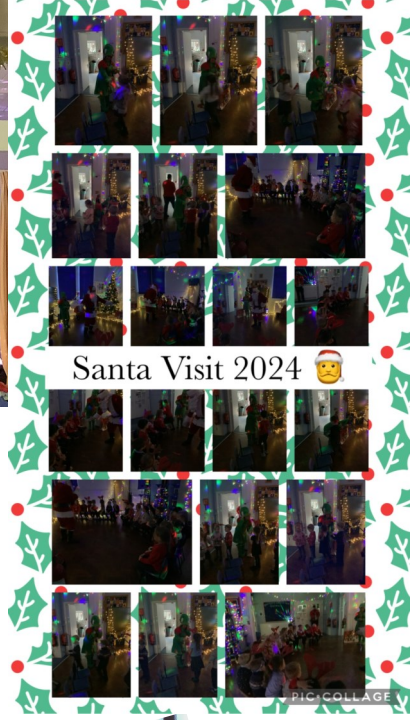
Santa Visit 2024 🎅